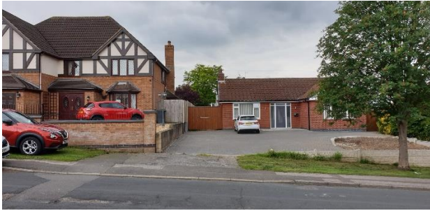
View of access from Mill Road and within site